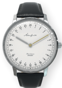
AK.001.SI.WH.BLE.001 FIRST SEASON SILVER WHITE WITH BLACK CALF LEATHER STRAP