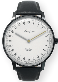
AK.001.BL.WH.BLE.001 FIRST SEASON BLACK WHITE WITH BLACK CALF LEATHER STRAP