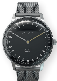
AK.001.SI.BL.SIMI.001 FIRST SEASON SILVER BLACK WITH SILVER MESH STRAP