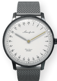
AK.001.BL.WH.SIMI.001 FIRST SEASON BLACK WHITE WITH SILVER MESH STRAP