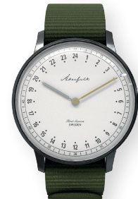
AK.001.BL.WH.GRNA.001 FIRST SEASON BLACK WHITE WITH GREEN NATO STRAP