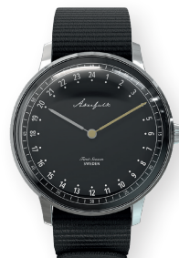
AK.001.SI.BL.BLNA.001 FIRST SEASON SILVER BLACK WITH BLACK NATO STRAP