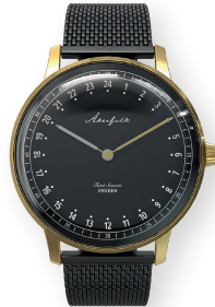
AK.001.GO.BL.BLMI.001 FIRST SEASON GOLD BLACK WITH BLACK MESH STRAP