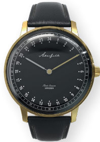
AK.001.GO.BL.BLE.001 FIRST SEASON GOLD BLACK WITH BLACK CALF LEATHER STRAP