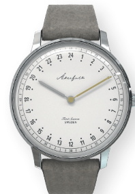
AK.001.SI.WH.GYMO.001 FIRST SEASON SILVER WHITE WITH LIGHT GREY MOCHA STRAP