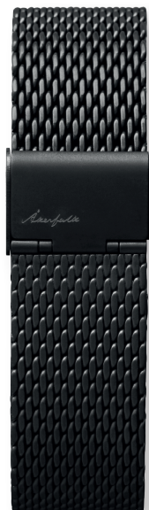
BLACK METAL MESH STRAP