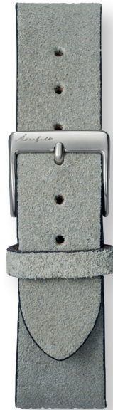
GREY MOCHA STRAP