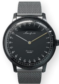
AK.001.BL.BL.SIMI.001 FIRST SEASON BLACK BLACK WITH SILVER MESH STRAP