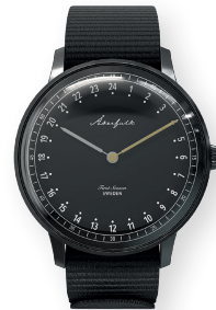
AK.001.BL.BL.BLNA.001 FIRST SEASON BLACK BLACK WITH BLACK NATO STRAP