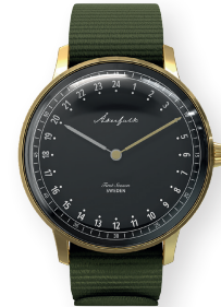
AK.001.GO.BL.GRNA.001 FIRST SEASON GOLD BLACK WITH GREEN NATO STRAP