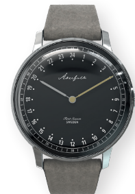
AK.001.SI.BL.GYMO.001 FIRST SEASON SILVER BLACK WITH LIGHT GREY MOCHA STRAP