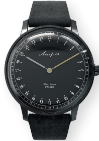
AK.001.BL.BL.BLMO.001 FIRST SEASON BLACK BLACK WITH BLACK MOCHA STRAP