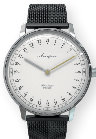
AK.001.SI.WH.BLMI.001 FIRST SEASON SILVER WHITE WITH BLACK MESH STRAP