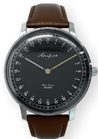
AK.001.SI.BL.BRLE.001 FIRST SEASON SILVER BLACK WITH BROWN CALF LEATHER STRAP