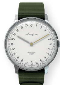
AK.001.SI.WH.GRNA.001 FIRST SEASON SILVER WHITE WITH GREEN NATO STRAP