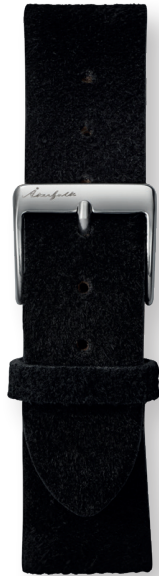
BLACK MOCHA STRAP

GET A NICE CASUAL AND RELAXED LOOK WITH OUR NATO STRAPS.