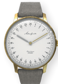
AK.001.GO.WH.GYMO.001 FIRST SEASON GOLD WHITE WITH LIGHT GREY MOCHA STRAP