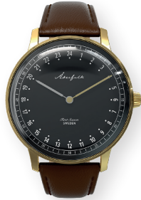
AK.001.GO.BL.BRLE.001 FIRST SEASON GOLD BLACK WITH BROWN CALF LEATHER STRAP