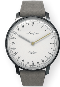
AK.001.BL.WH.GYMO.001 FIRST SEASON BLACK WHITE WITH LIGHT GREY MOCHA STRAP