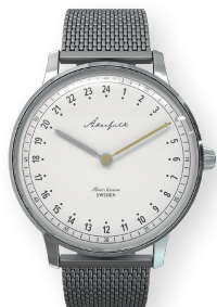
AK.001.SI.WH.SIMI.001 FIRST SEASON SILVER WHITE WITH SILVER MESH STRAP