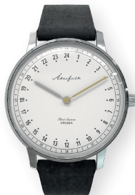
AK.001.SI.WH.BLMO.001 FIRST SEASON SILVER WHITE WITH BLACK MOCHA STRAP