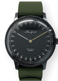
AK.001.BL.BL.GRNA.001 FIRST SEASON BLACK BLACK WITH GREEN NATO STRAP