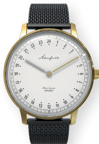
AK.001.GO.WH.BLMI.001 FIRST SEASON GOLD WHITE WITH BLACK MESH STRAP