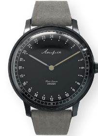
AK.001.BL.BL.GYMO.001 FIRST SEASON BLACK BLACK WITH LIGHT GREY MOCHA STRAP