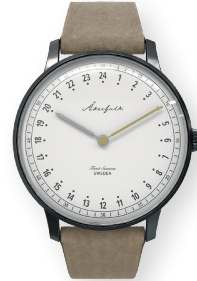
AK.001.BL.WH.BRMO.001 FIRST SEASON BLACK WHITE WITH LIGHT BROWN MOCHA STRAP