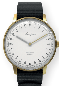
AK.001.GO.WH.BLNA.001 FIRST SEASON GOLD WHITE WITH BLACK NATO STRAP