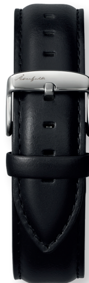
BLACK LEATHER STRAP