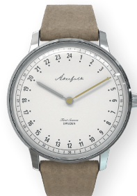
AK.001.SI.WH.BRMO.001 FIRST SEASON SILVER WHITE WITH LIGHT BROWN MOCHA STRAP