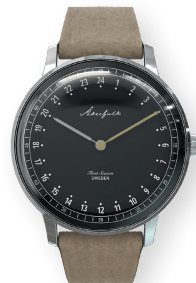
AK.001.SI.BL.BRMO.001 FIRST SEASON SILVER BLACK WITH LIGHT BROWN MOCHA STRAP