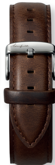
BROWN LEATHER STRAP

■ BRLE.SI.001 ■ BRLE.GO.001 ■ BRLE.BL.001