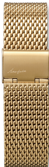
GOLD METAL MESH STRAP