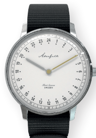
AK.001.SI.WH.BLNA.001 FIRST SEASON SILVER WHITE WITH BLACK NATO STRAP