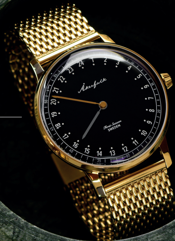
AK.001.GO.BL.GOMI.001 FIRST SEASON GOLD BLACK WITH GOLD MESH STRAP