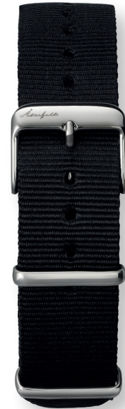
BLACK NATO STRAP