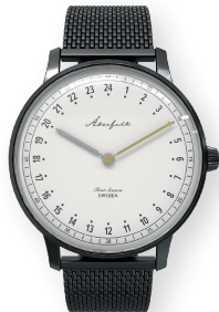
AK.001.BL.WH.BIMI.001 FIRST SEASON BLACK WHITE WITH BLACK MESH STRAP