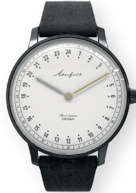
AK.001.BL.WH.BLMO.001 FIRST SEASON BLACK WHITE WITH BLACK MOCHA STRAP