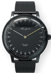
AK.001.BL.BL.BLMI.001 FIRST SEASON BLACK BLACK WITH BLACK MESH STRAP