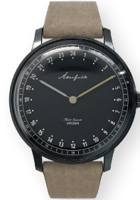
AK.001.BL.BL.BRMO.001 FIRST SEASON BLACK BLACK WITH LIGHT BROWN MOCHA STRAP