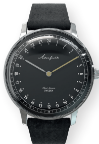
AK.001.SI.BL.BLMO.001 FIRST SEASON SILVER BLACK WITH BLACK MOCHA STRAP