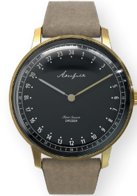
AK.001.GO.BL.BRMO.001 FIRST SEASON GOLD BLACK WITH LIGHT BROWN MOCHA STRAP