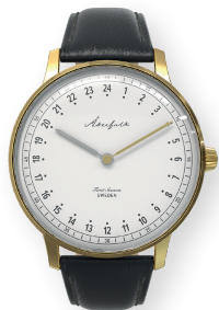
AK.001.GO.WH.BLE.001 FIRST SEASON GOLD WHITE WITH BLACK CALF LEATHER STRAP