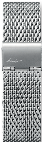
SILVER METAL MESH STRAP

GET THE ATTENTION WITH THE AMAZING LOOK OF OUR METAL MESH STRAPS. FITS ALL WRISTS WITH THE ADJUSTABLE BUCKLE.