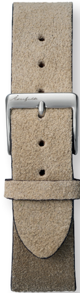
LIGHT BROWN MOCHA STRAP