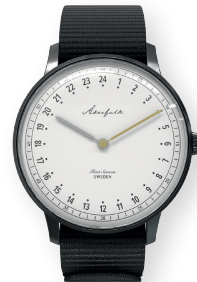
AK.001.BL.WH.BLNA.001 FIRST SEASON BLACK WHITE WITH BLACK NATO STRAP