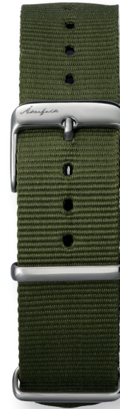
GREEN NATO STRAP