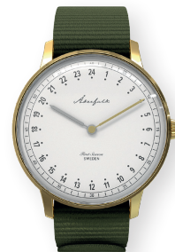
AK.001.GO.WH.GRNA.001 FIRST SEASON GOLD WHITE WITH GREEN NATO STRAP