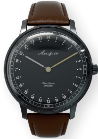
AK.001.BL.BL.BRLE.001 FIRST SEASON BLACK BLACK WITH BROWN CALF LEATHER STRAP