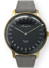
AK.001.GO.BL.GYMO.001 FIRST SEASON GOLD BLACK WITH LIGHT GREY MOCHA STRAP