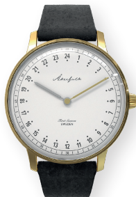
AK.001.GO.WH.BLMO.001 FIRST SEASON GOLD WHITE WITH BLACK MOCHA STRAP