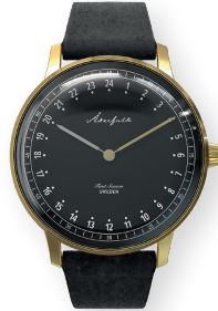
AK.001.GO.BL.BLMO.001 FIRST SEASON GOLD BLACK WITH BLACK MOCHA STRAP