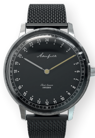
AK.001.SI.BL.BIMI.001 FIRST SEASON SILVER BLACK WITH BLACK MESH STRAP