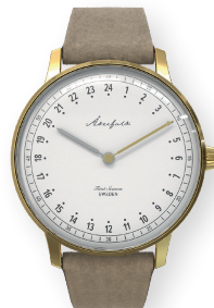
AK.001.GO.WH.BRMO.001 FIRST SEASON GOLD WHITE WITH LIGHT BROWN MOCHA STRAP