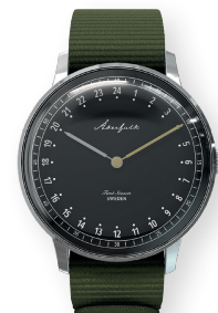
AK.001.SI.BL.GRNA.001 FIRST SEASON SILVER BLACK WITH GREEN NATO STRAP