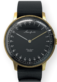
AK.001.GO.BL.BLNA.001 FIRST SEASON GOLD BLACK WITH BLACK NATO STRAP